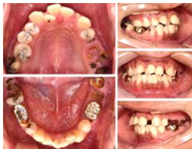
Fig. 1. pretreatment intra-oral photos.

The patient was achieved Class I relationship and favorable occlusion with dental implant restorations.