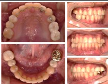
Fig. 3. posttreatment intra-oral photos.